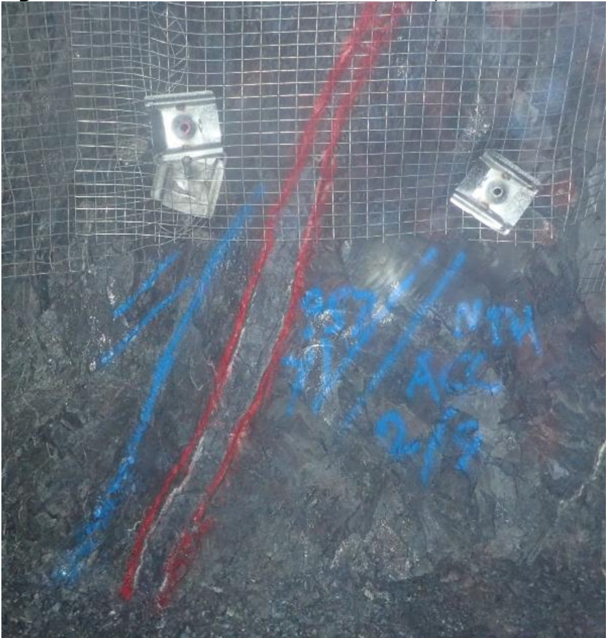
Figure 2: Youle Lode Face at the North Access, 957 Level